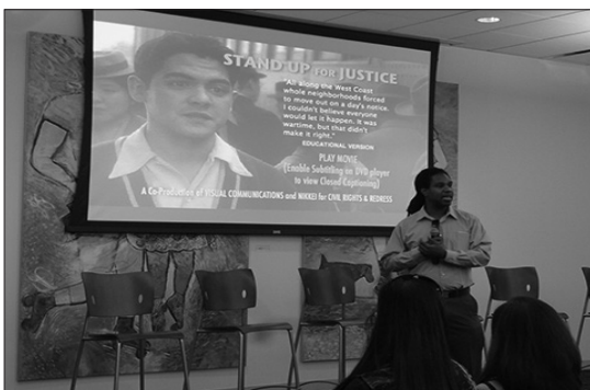
Screening for 100 employees at the downtown L.A. Southern Cal Gas Company.

The committee spent a significant amount of time in 2012 selecting 20 testimonies from the 1981 Los Angeles Commission on Wartime Relocation and Internment of Civilians (CWRIC) hearings for inclusion on the Densho website. The committee reviewed