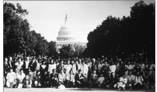
NCR's historic 1987 lobbying delegation to Washington, DC.